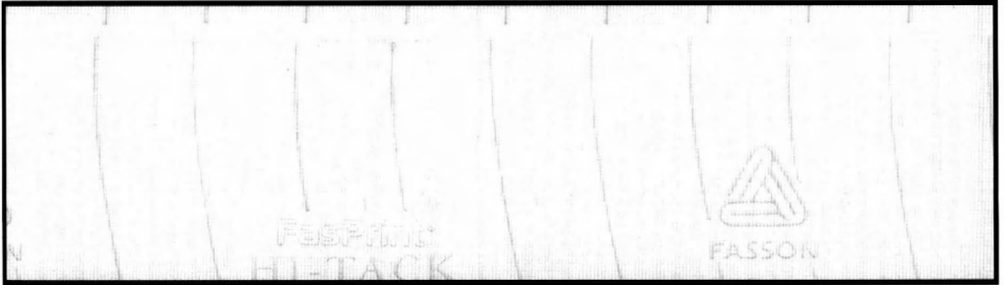
Fasson FasPrint Hi-Tack permanent